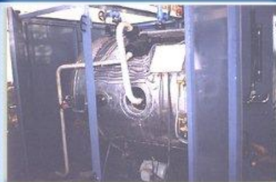
Three Way Valve Arrangement