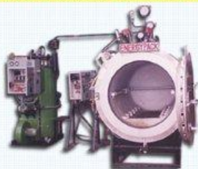
Autoclave With External Steam Generation Unit

Design With Internal Electrical Heating / Separate Diesel Heating System To Generate Steam For De-Waxing Shells.