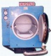
Autoclave With Electrical Heater

MANUFACTURED IN INDIA & MORE THAN 10 SUCESSFULL INSTALLATIONS